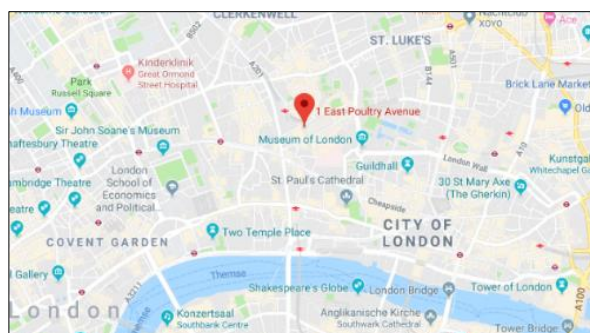
Innovation Warehouse - 1 E Poultry Avenue, London, EC1A 9PT

We believe that a classroom should be an inspiring place. Here at Klazz, we have carefully selected a range of co-working spaces for you to learn in. We believe that classrooms should be light, bright, productive and open. By choosing these styles venues over traditional classrooms your learning environment will be modern and motivational.